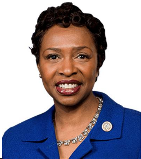
Congresswoman YVETTE D. CLARKE